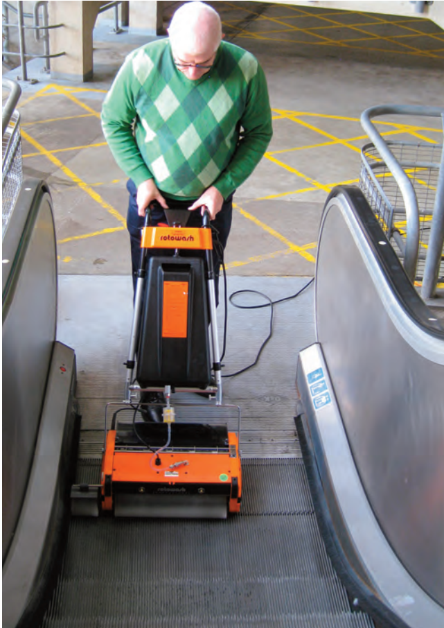
Escalator Conversion Kit for B Models